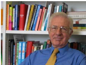
Prof. Lord Richard Layard Director of Well-Being Programme, Centre for Economic Performance, London School of Economics, United Kingdom