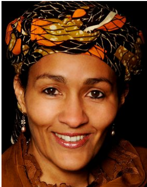
Amina J. Mohammed UN Assistant Secretary-General and Special Advisor on Post-2015 Development Planning, Nigeria

Born in Nigeria, Ms Amina looks back on over 30 years of experience as a development practitioner in the public and private sector. She is the founder of the 'Center for Development Policy Solutions', a think-tank addressing policy and knowledge gaps. She served as the Senior Special Assistant to the President of Nigeria on the Millennium Development Goals. In 2012, UN Secretary-General Ban Ki-moon appointed her as a Special Advisor on the Post-2015 Development Planning.