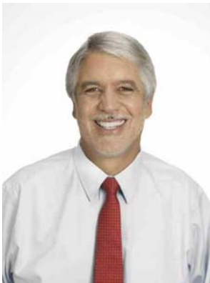
Dr. Enrique Peñalosa Board President of the Institute for Transportation and Development Policy; former mayor of Bogotá, Colombia