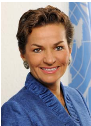
Christiana Figueres Executive Secretary of the United Nations Framework Convention on Climate Change (UNFCCC)